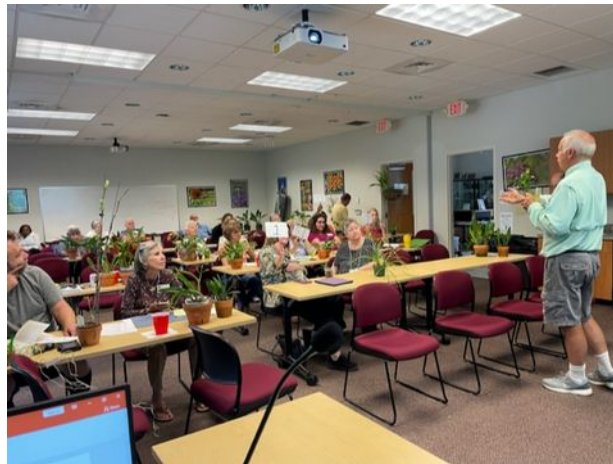
Coercion by intimidation to extract more money from bidders, promoting demand for plants. Over 90 orchid went home with NEW owners! TOS got an injection of funds too!