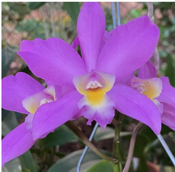
Jamie Krochmal-Cattleya maxima