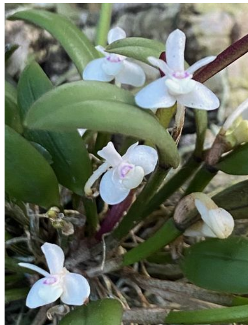
Jamie Krochmal-Schoenorchis fragrans