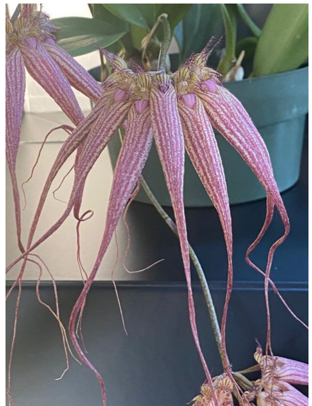
Jamie Krochmal- Bulb. longissimum