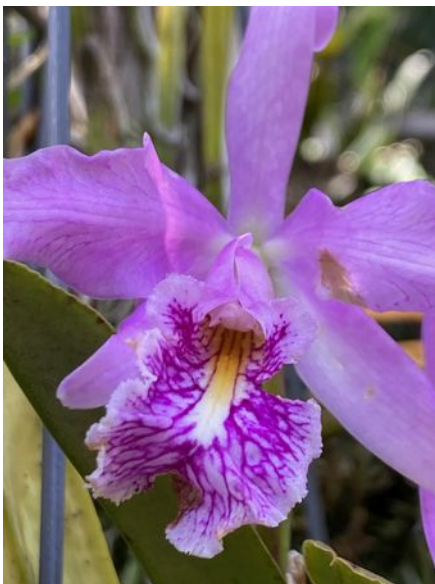
Jamie Krochmal- Cattleya maxima