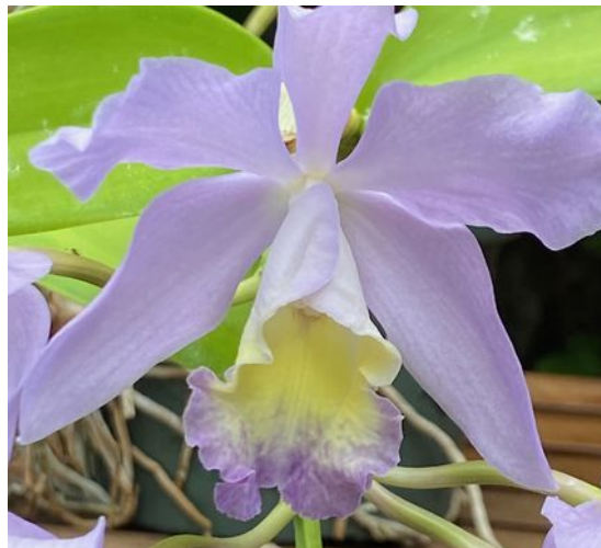
Jamie Krochmal-LC Minerva coerulea 'Gran Wisteria' AM/AOS