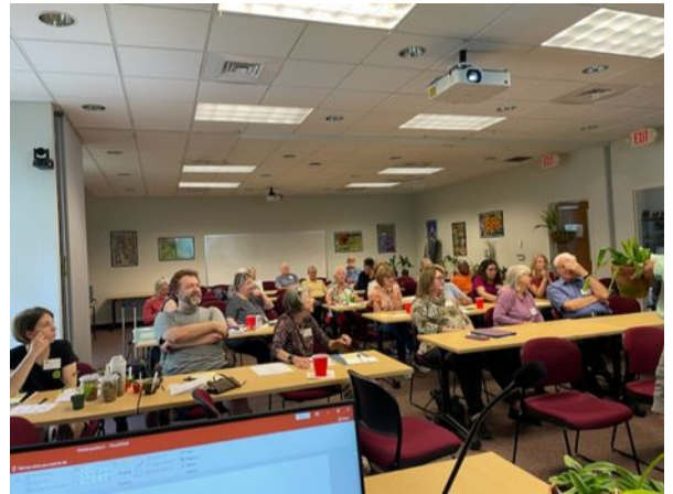
Short discussion about features of each orchid being auctioned away to a new owner.