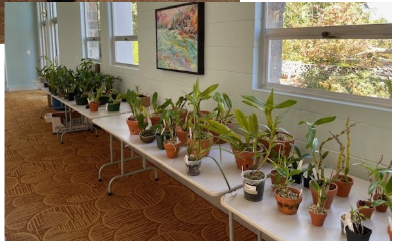
Plants in line for being auctioned.