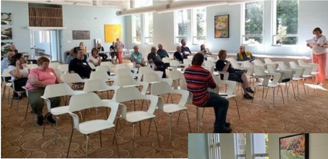
Beginning of October Meeting