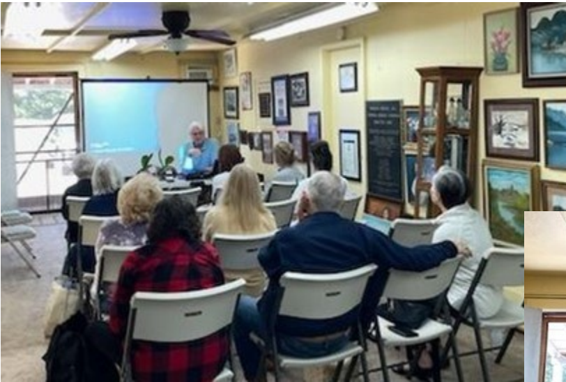
This month's class went over orchids that were purchased at the auction on Sunday as well as "problem" orchids we had at home.