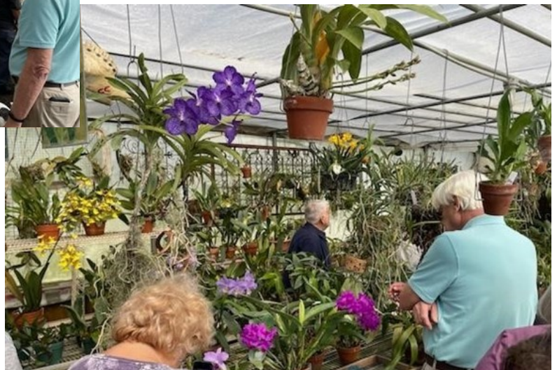
Above & right: Visiting the greenhouse to see Viaji's orchids and what is in bloom at that time.

**The monthly plant photo on page one is the Oncidium Brazilian Sun.