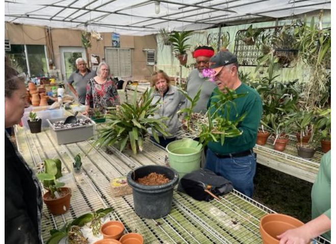
Outlining options to consider dividing this orchid