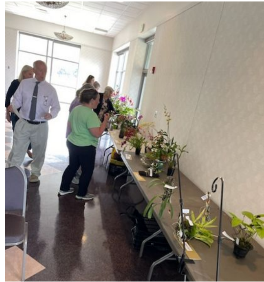
Really beautiful Member Orchids brought in for table judging