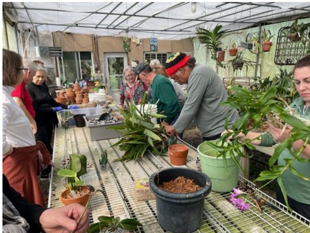
Hands on, dividing an orchid