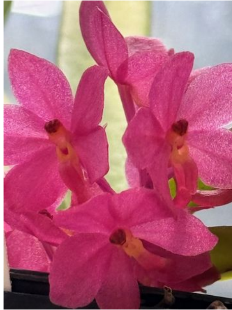
Jamie Krochmal- Ascocentrum ampullaceum