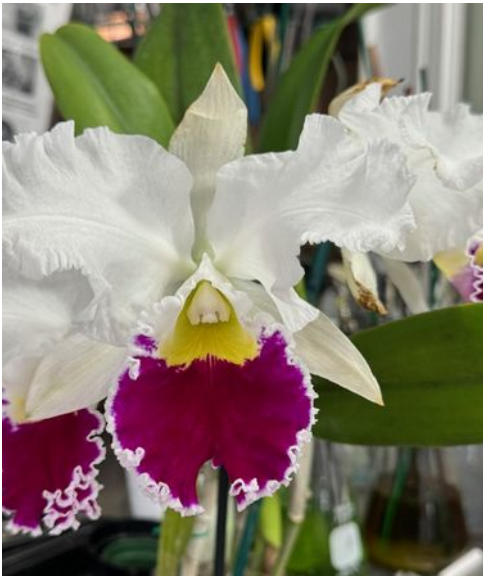
Jamie Krochmal-Lc. Supersonic 'Striking Lip'