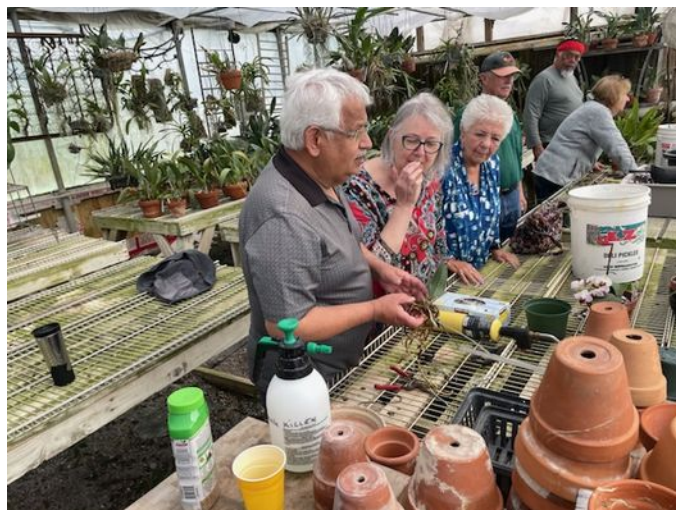
Old planting medium removed, getting ready to add new medium, it's a wardrobe change for an orchid!

We had lots of member discussions about growing and repotting of orchids. I think it was a good session, we all learned a lot!