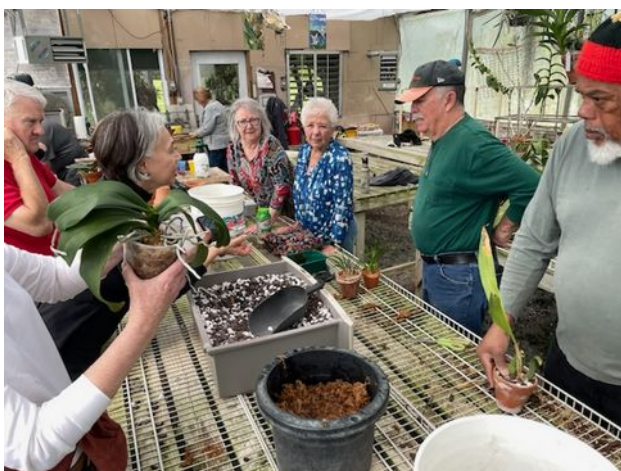
More repotting guidance