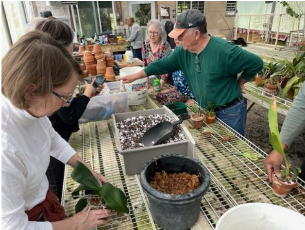
Repotting ingredients, guidance about protecting roots, using moss with orchid bark mix, etc.