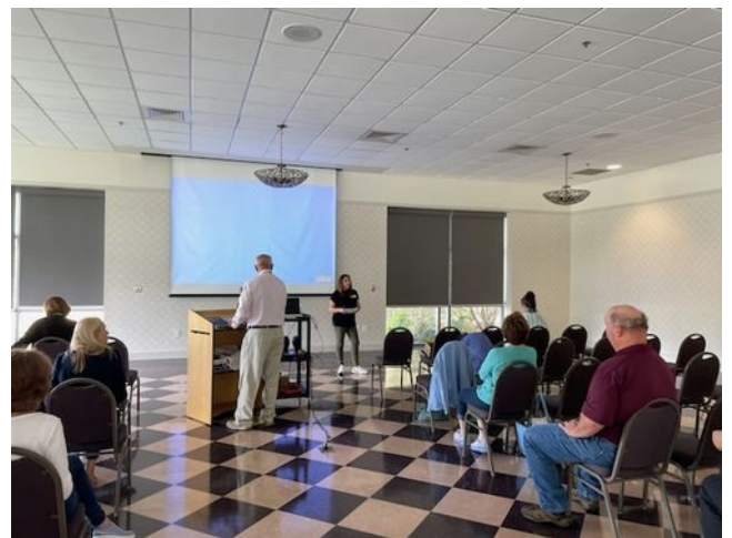
President Sandra Cross Opening the meeting, a few admin remarks, take a pause before presentation, allow for table judging