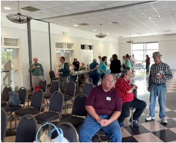
Getting acquainted before the meeting

The Tidewater Orchid Society held its monthly meeting on 5 May, 2024 in the Rose Room at Norfolk Botanical Gardens, Norfolk, VA.