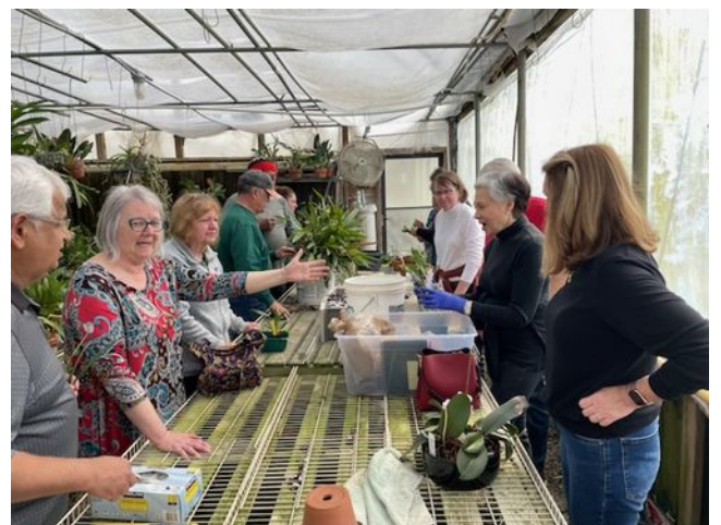
Repotting discussions between members