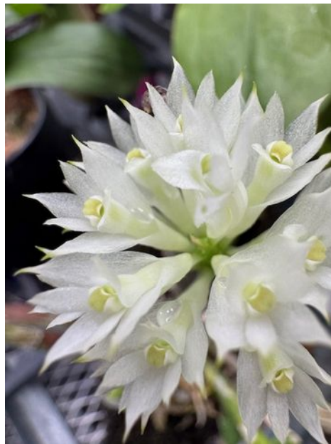
Jamie Krochmal- Dendrobium Secundum 'Alba'