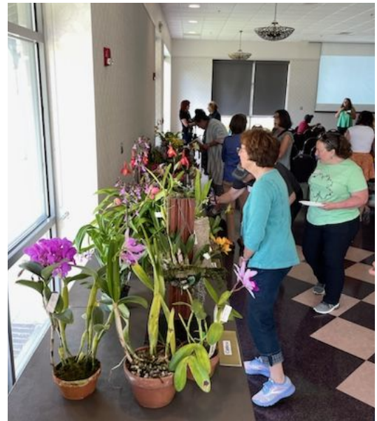
TOS members admiring the orchids