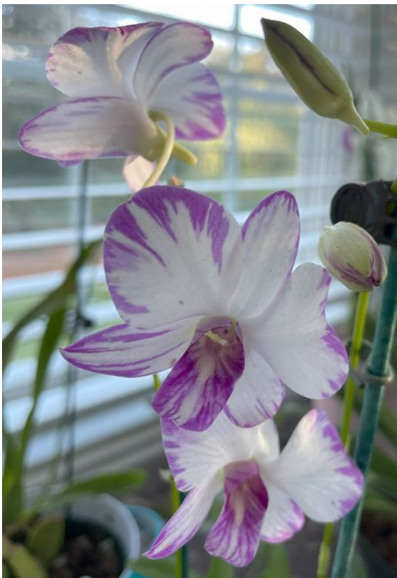
Louise Roesser-Den. Enobi Purple 'Splash'