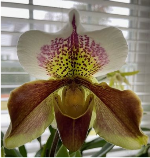
Louise Roesser-Paph. Sheldrake x Paph. Marlborough