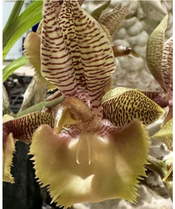
Jamie Krochmal-Ctsm Edgerdo A Pauneto 'SVO' AM/AOS