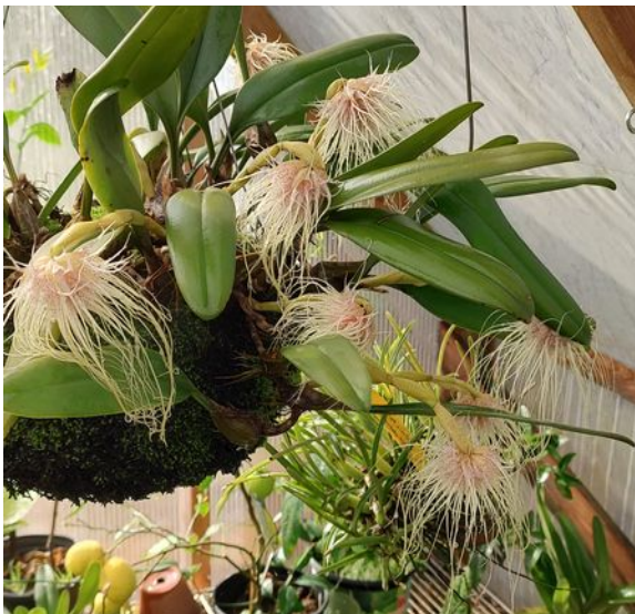
Brandt Moran-Bulbophyllum medusae