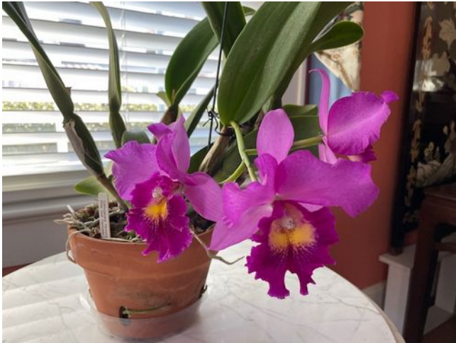
Louise Roesser-Cahuzacara Hsinying Pink Doll 'Hsinying'