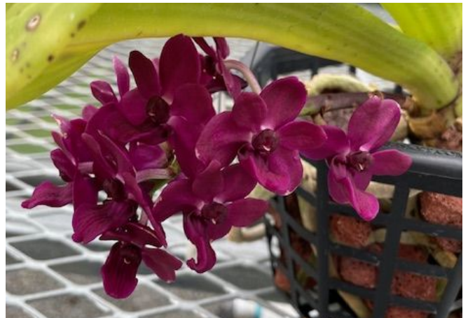
Louise Roesser-Rhynchostylis gigantea 'Red'