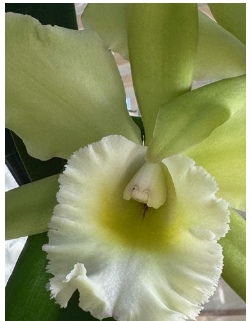
Jamie Krochmal-Blc Esmeralda 'Heritage' AM/AOS