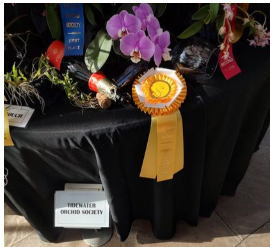
TOS Table Award from the VOS show