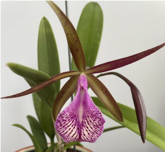
Louise Roesser-BLC Gulfshore's Beauty