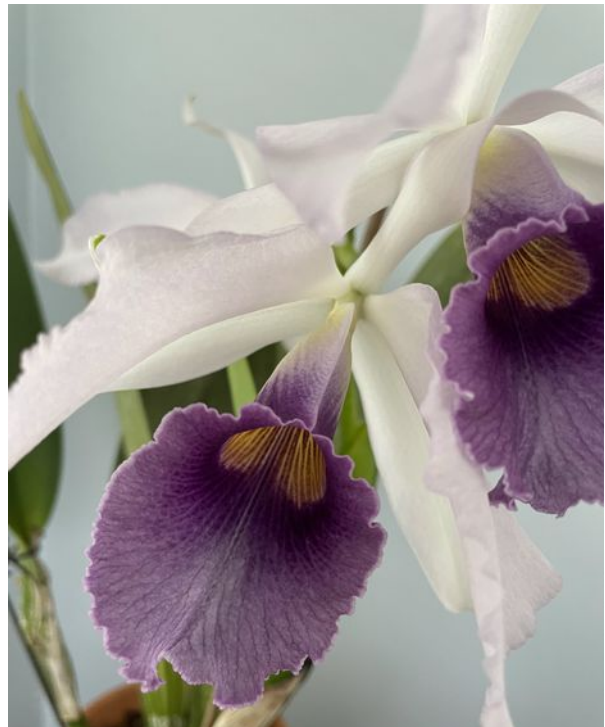
Louise Roesser-Lc C.G. Roebling 'Beechview' var. coerulea AM/AOS