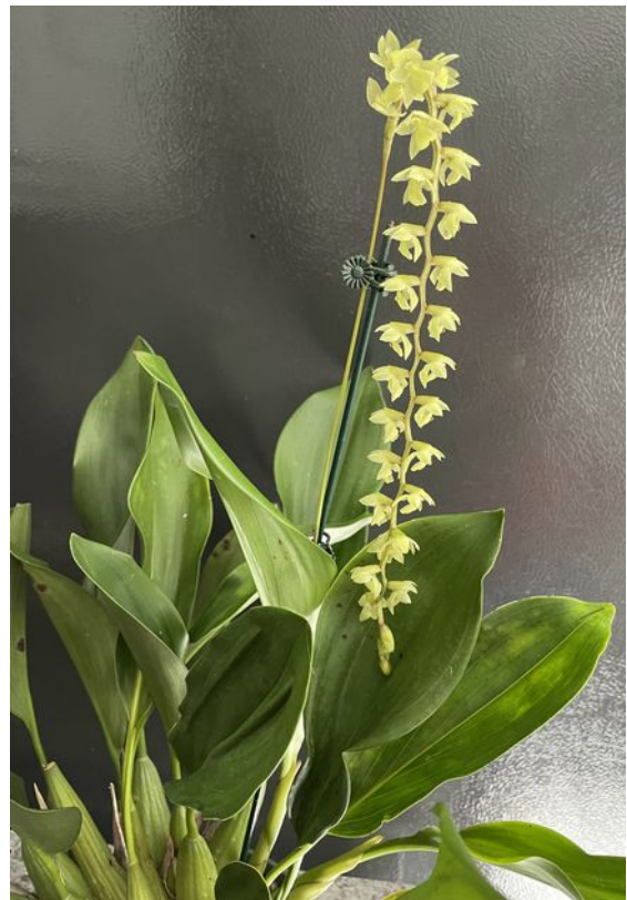
Dendrochilum cobbianum 'Chartreuse Sentinel'