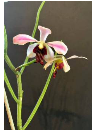
Alice Snyder's Papilionanthe taiwaniana