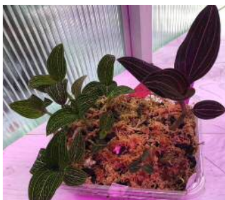
Kathy Greaser's Ludisia discolor collection