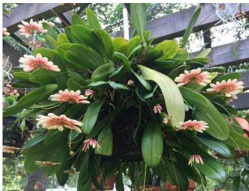
Louise Roesser's Bulb flabellum-veneris