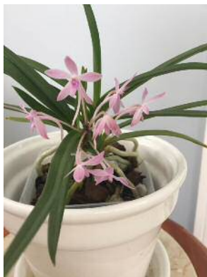
Louise Roesser's Neofinetia falcata cross