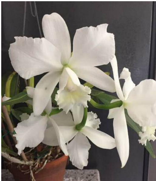
Louise Roesser's C Hawaiian Wedding Song 'Virgin'