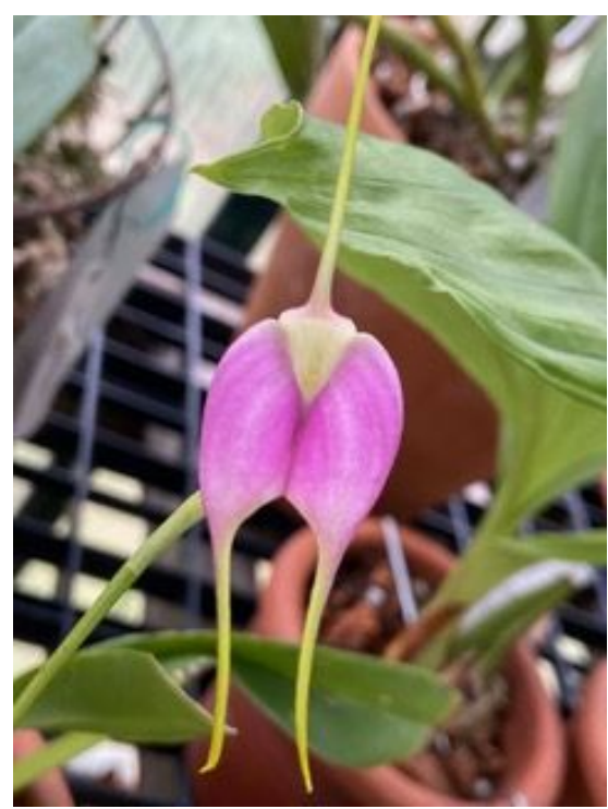
Masdevallia 'Redwing'