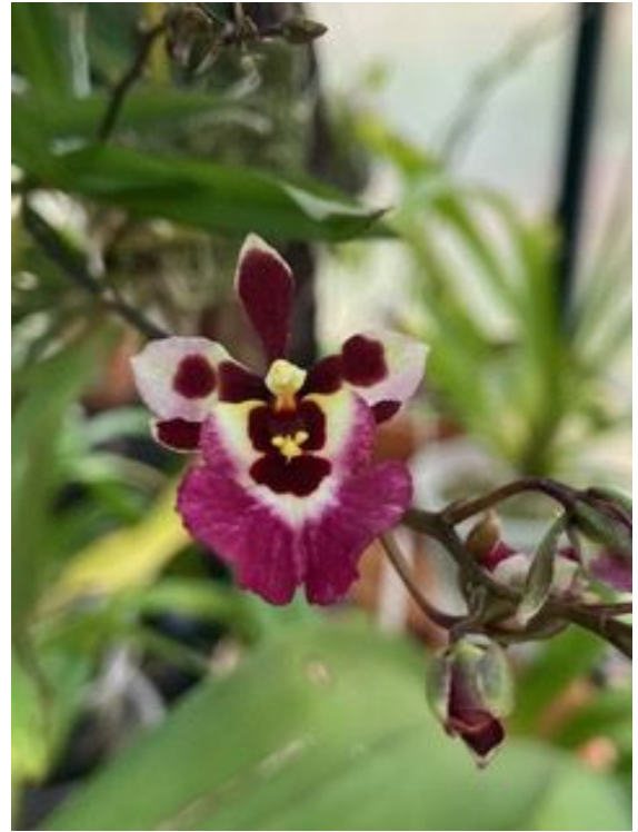
Tolumnia Red Mask